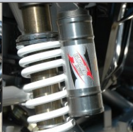
pro peg nerf bars