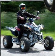
fantastic on the road