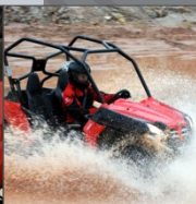
great on/off road performance